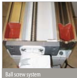
Ball screw system

Electric controls 24V Pair of parallel supports 135x350 mm Edge clamp (4 pieces) and Toe clamp (4 pieces) Service tool and operating manual