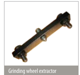
Grinding wheel extractor