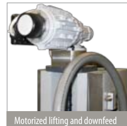
Motorized lifting and downfeed