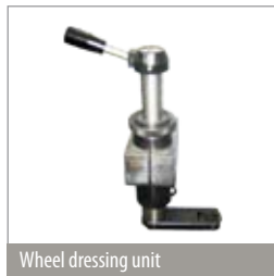
Wheel dressing unit