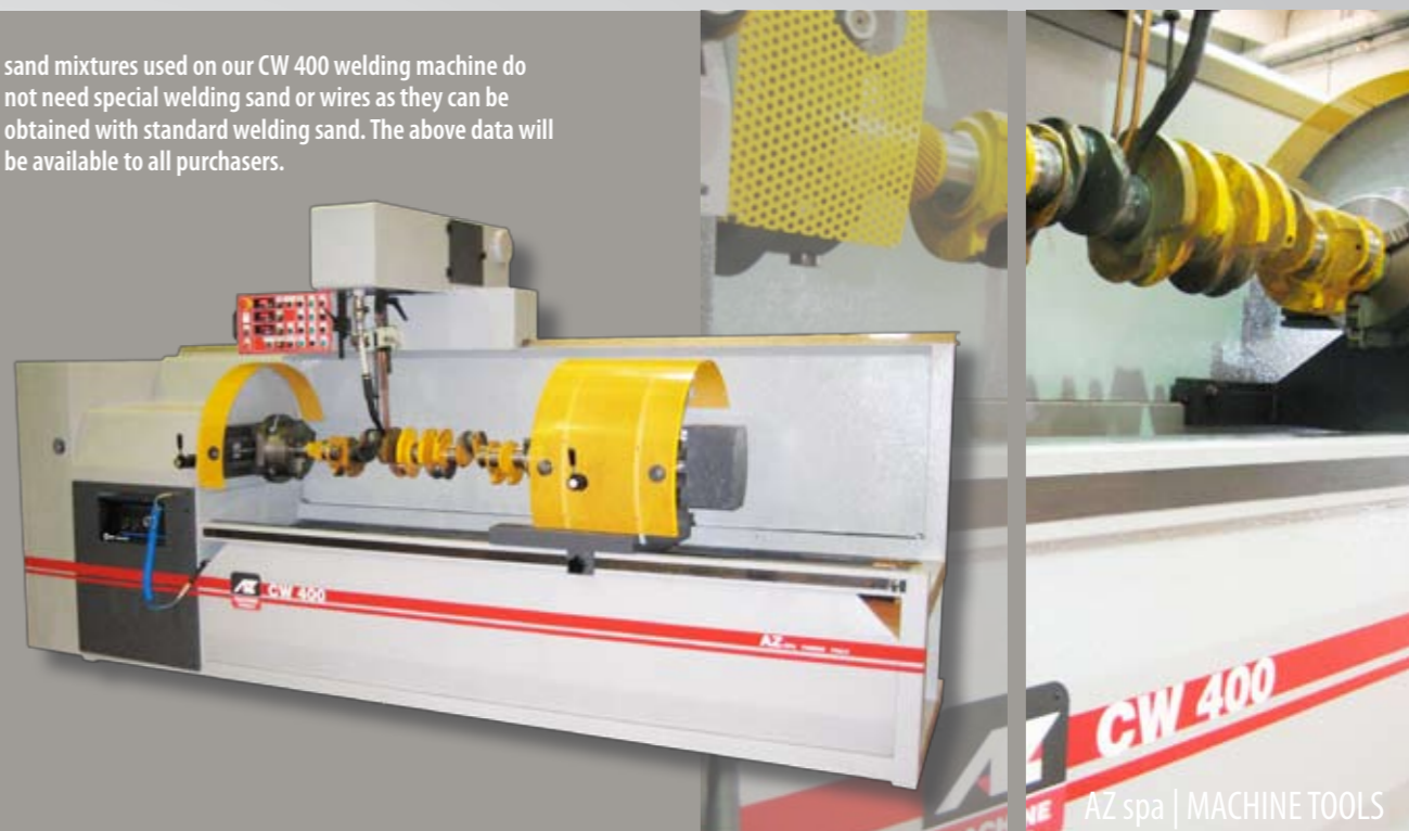
AZ spa | MACHINE TOOLS

sand mixtures used on our CW 400 welding machine do not need special welding sand or wires as they can be obtained with standard welding sand. The above data will be available to all purchasers.