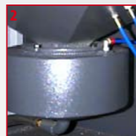
3-4. index pins 5. welding system