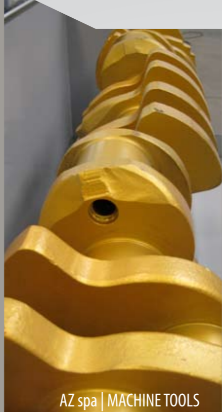
AZ spa | MACHINE TOOLS

Submerged arc welding is a process for which the electric arc is covered by granulated material called welding sand. The electric arc provides to fuse the wire, with base shaft material. The welding sand is a composition of silicon, chromium, manganese, molybdenum coal etc., It completely covers electric arc using welding operations. Furthermore, the welding sand protects the welding with a particular atmosphere and does not hurt the worker's eyes. The submerged arc welding offers excellent characteristics on the crankshaft by removing all the elements which cause a quality change of deposited material. A wire and welding composition gives a hardness deposit of 50 - 55 Rockwell on the bearings area. The hardness is determined also by the type of welding sand used. Therefore, it is possible to obtain any necessary hardness. Usually Rockwell hardnesses, that may be found in nearly all crankshafts either for cars or the trucks, vary from 35 Rockwell to 45 - 50 Rockwell. The welding