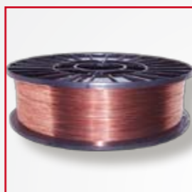
welding wire - thickness of your choice